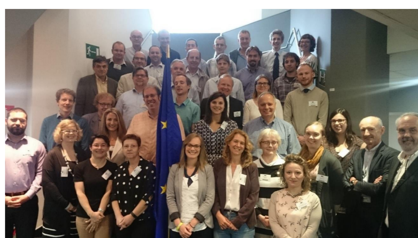
Photo taken during the Kick-off meeting in Brussels